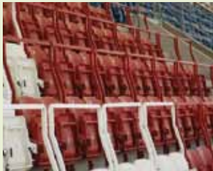
▲ Stadium seating in Bahrain.

It is essential that steel and aluminium in construction projects are resistant to corrosion; Plascoat PPA 571 achieves this goal.