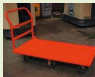
▼ PPA 571 coated cart after 18 months' use.