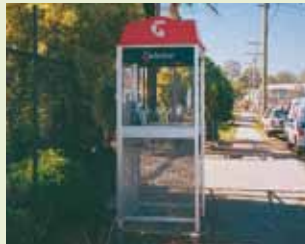
▲ Grill coated in polyester.

Bus shelters, cycle racks, benches, waste bins, road culverts, balustrading and many other items of street furniture have benefited from PPA 571, which has consistently out-performed traditional coatings in these applications.