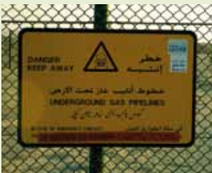
▼ Pipeline protection fence in the Middle East after 12 years.

In this environment, resistance to high UV, intense heat, salt, sea and desert storms is key. Traditional coatings in these conditions do not last well, as many long-term field tests have shown.