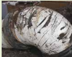
▲ Ductile iron pipe with deteriorated PVC tape wrap after 5 years.