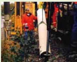
▼ Concrete reinforced piles in Scandinavia.