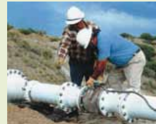
▲ PPA 571 withstands UV, sulphuric acid, chlorides and slurries for a ferric cure line in Arizona.