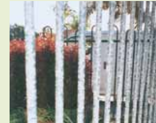
▲ Aluminium fencing coated in green polyester after just 18 months by the sea in Brisbane, Australia.

Live tests in the US have shown that the salt spray corrosion rate and the abrasion rate of PPA 571 are half those of standard coatings and the fading rate is 1/20th.