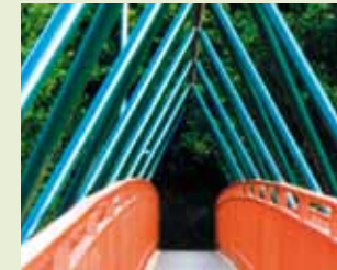
◀◀ Plascoat PPA 571 in good condition after 18 years.

In the event of fire, the smoke generation from PPA 571 is both low and slow. In addition, the smoke is of extremely low toxicity. This makes PPA 571 often the costing of choice in tunnels and enclosed public buildings.