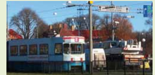
▲ Graffiti and fly-poster resistant lampposts in Sweden.

Lampposts in particular need extra protection at ground level where dogs frequently contaminate the environment. Trials at the Swedish Corrosion Institute have proved that thermoplastic coatings such as PPA 571 are one of only three out of 52 corrosion protection systems that can extend the life of a lamppost by up to 50 years.