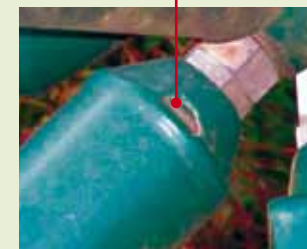
▼ No under-film corrosion after 12 years