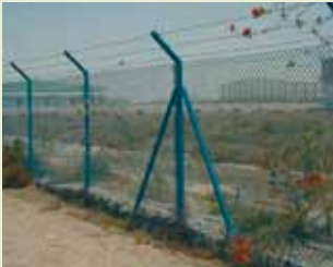
▲ Successful 10-year field test in Dubai.

The abrasion rate of PPA 571 is half that of standard coatings and the fading rate is 1/20th.