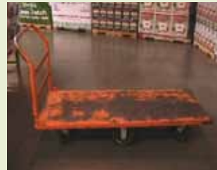
▲ Storage cart coated in liquid paint after 18 months' use.

PPA 571 thermoplastic powders are being used for a wide variety of applications – including fire extinguishers, battery boxes, fan-guards, tanks, school furniture, shopping trolleys, stadium seating and submersibles.