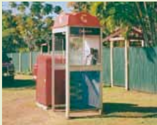
▲ Grill coated in PPA 571.